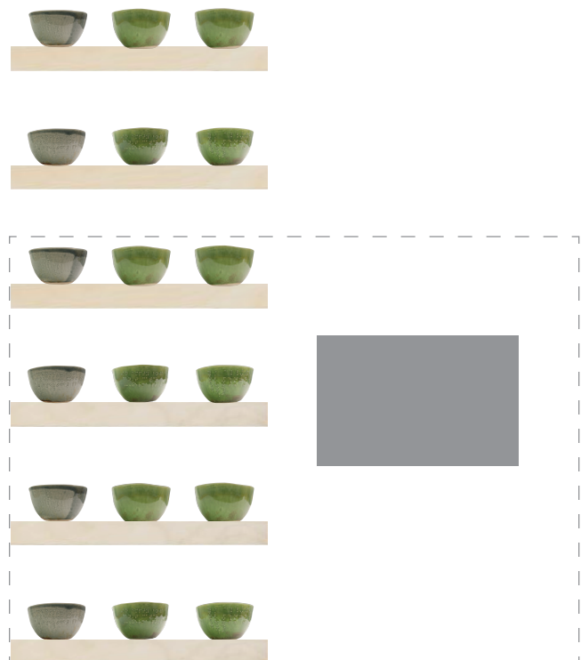
Figure 1. Possible physical arrangement of the display. The grey area shows the size of a 11" × 17" piece of paper (likely the size of my panel). The dotted area shows the size of a typical research poster (4' × 3').